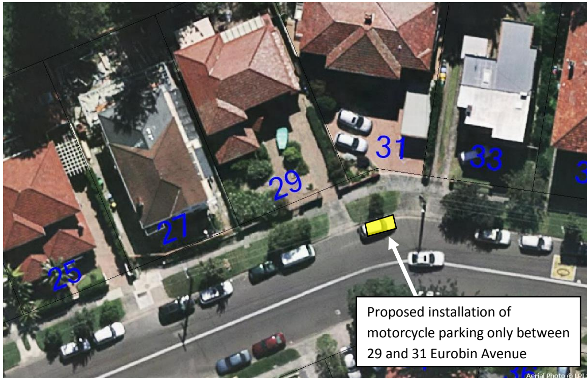
Figure 1: Proposed implementation of motorcycle parking only between 29 and 31 Eurobin Avenue, Manly