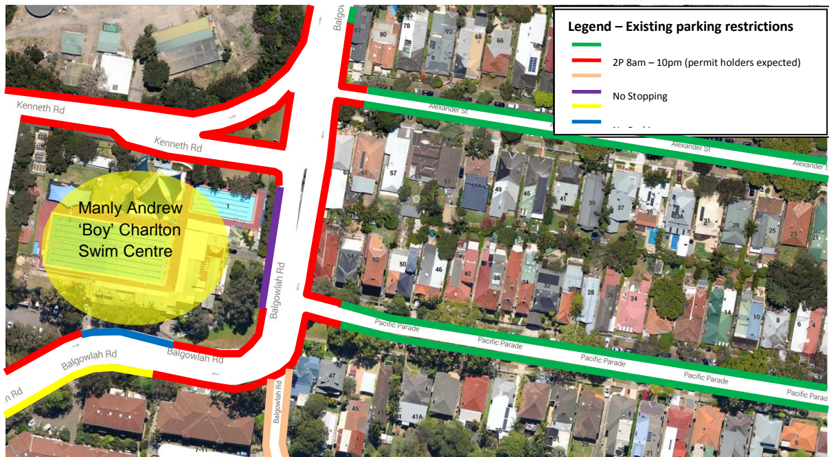
Figure 1: Swim centre and existing parking restrictions