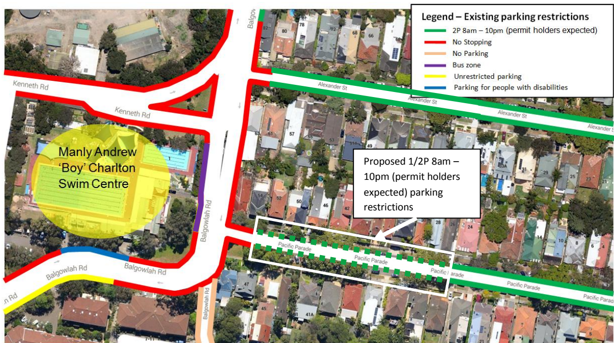
Figure 2: Existing and proposed parking restrictions of 1/2P along a section of Pacific Parade