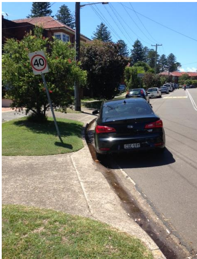
Figure 2: Vehicle parked over the driveway at 29 Eurobin Avenue, Manly