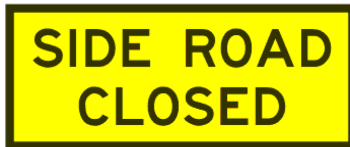
SIDE ROAD CLOSED SIGN (T1 – 32)