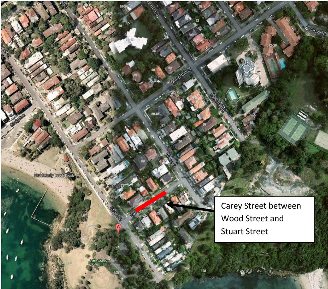
Figure 1: Street party to be held at Carey Street between No 18 and 28