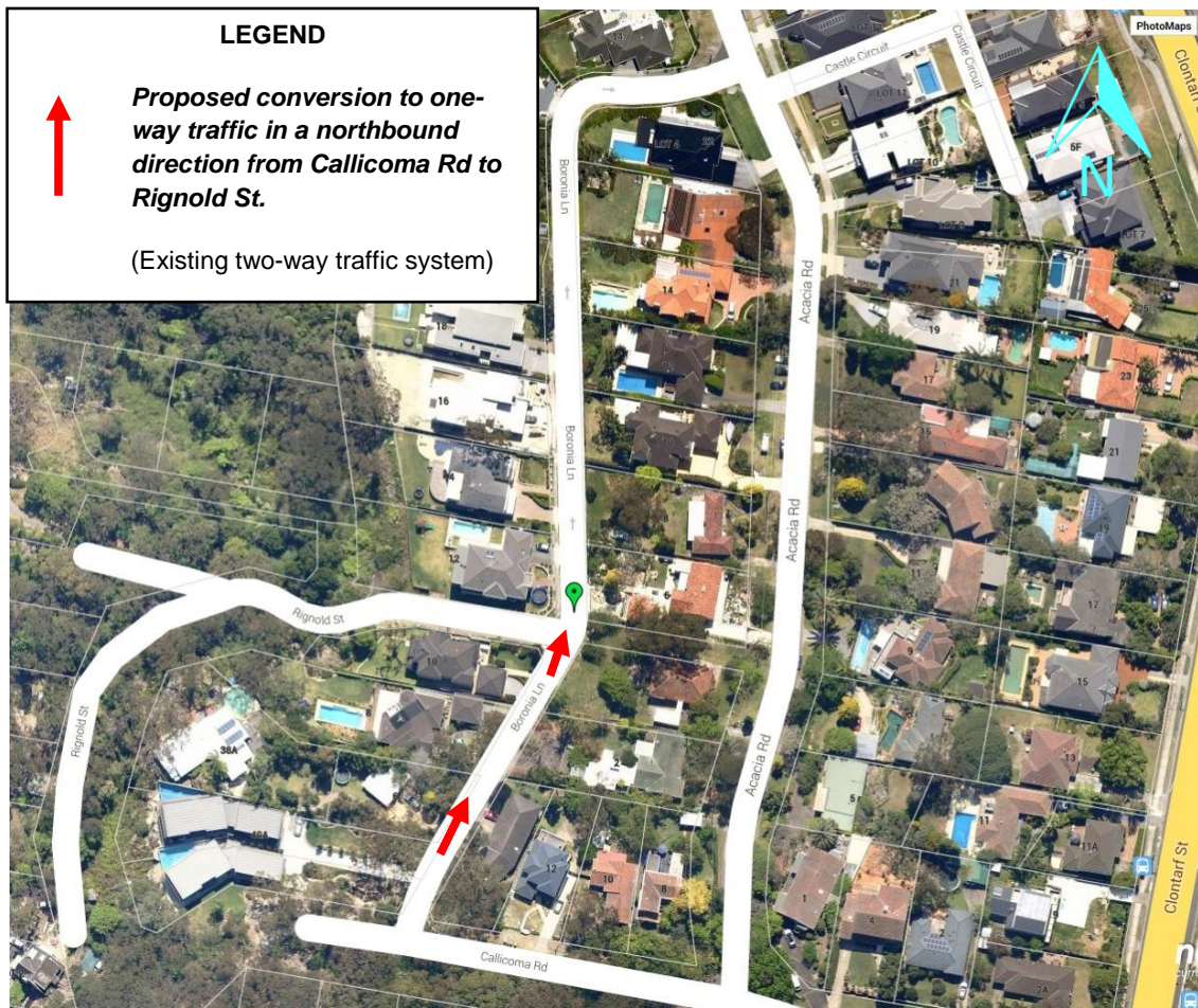
Figure 2: Proposal for one-way traffic northbound on Boronia Lane from Callicoma Rd to Rignold St