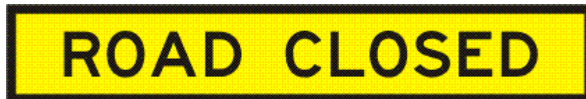
ROAD CLOSED SIGN – (T2 – 4)