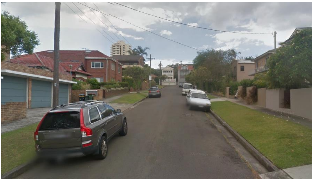
Figure 2: Street party to be held at Carey Street, Manly