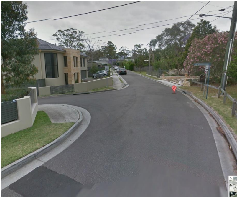
Figure 1: Intersection of Rignold St and Boronia Ln transition from two-way to one-way northbound