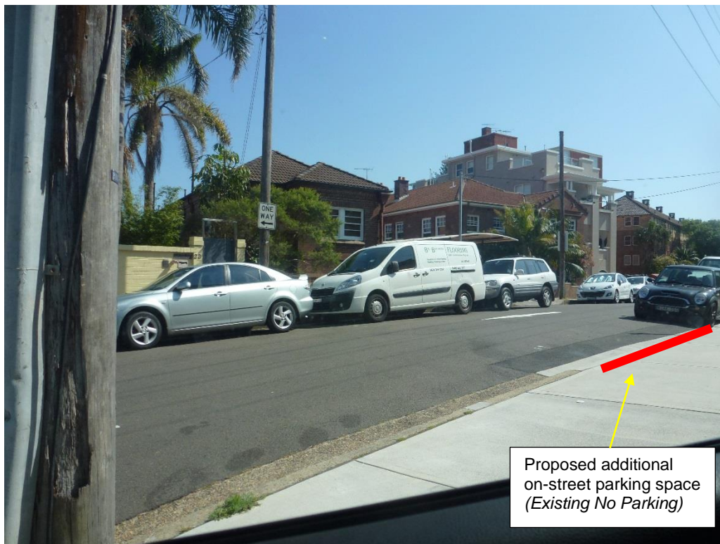
Figure 2: Current sight visibility exiting out of the Hospital car park