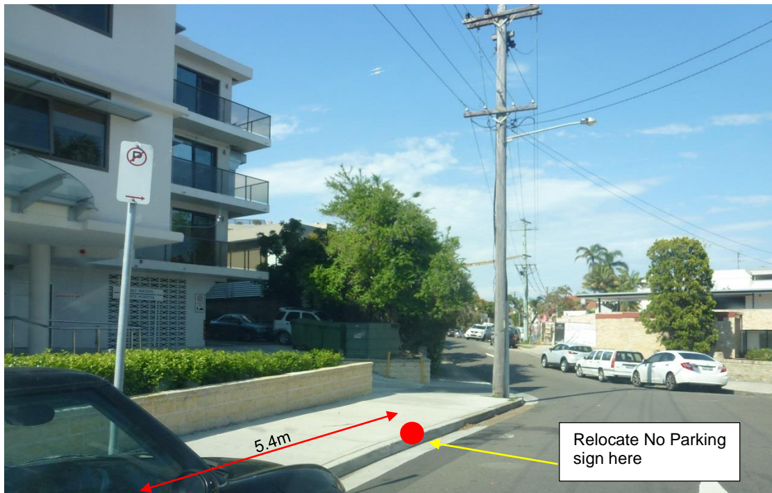
Figure 1: Cove Ave – Frontage of the Manly Waters Private Hospital