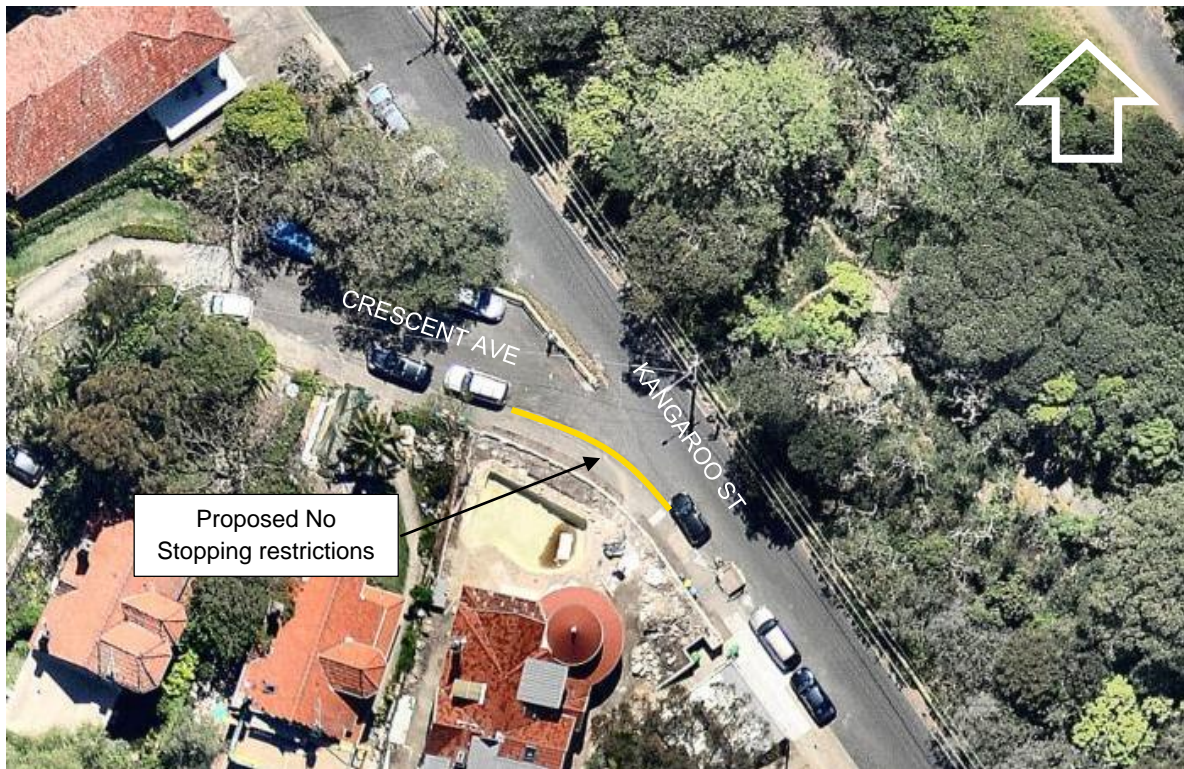
Figure 1: Crescent Avenue / Kangaroo St intersection – Proposed No Stopping