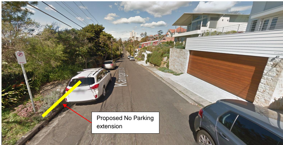
Figure 2: Kangaroo St – Street view