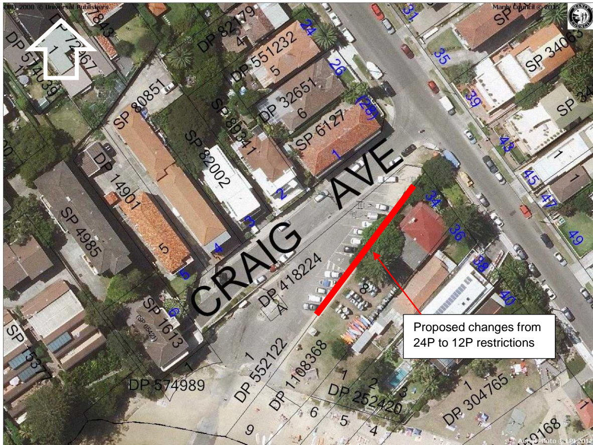
Figure 1: Little Manly (Craig Ave) – Proposed changes from 24P to 12P