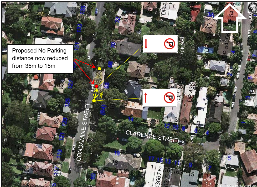
Figure 2: Condamine Street, Balgowlah – Proposed No Parking Zone