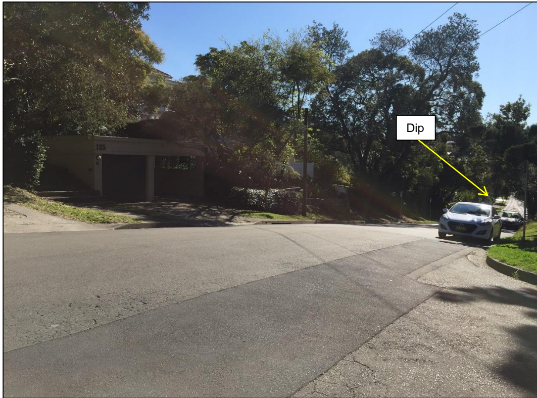
Figure 1: Clarence Street, Balgowlah – Sight visibility onto Condamine Street