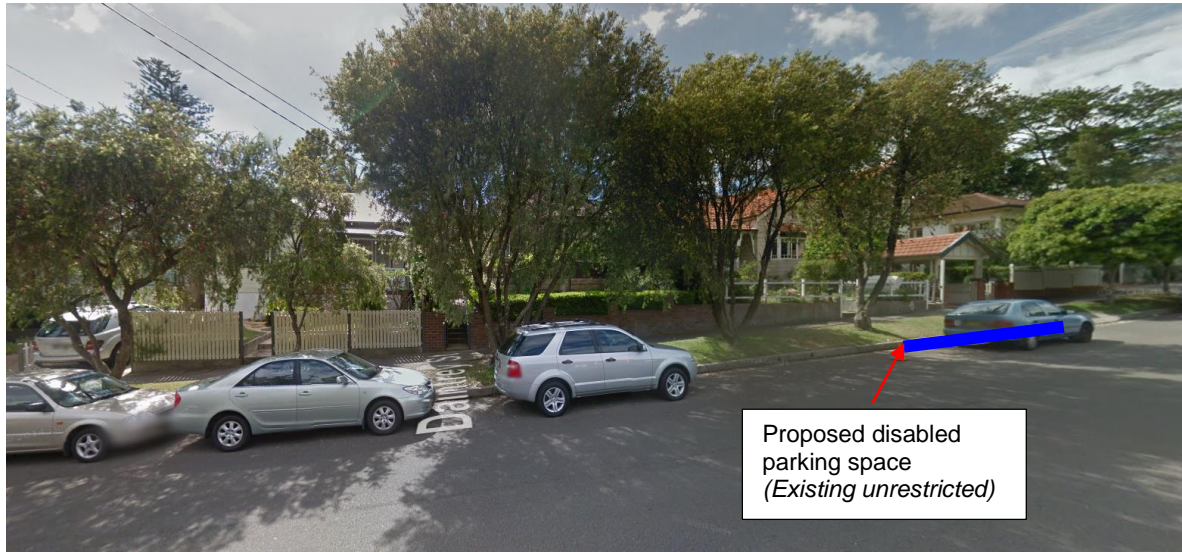
Figure 1: Daintrey Street – Proposed disabled parking space