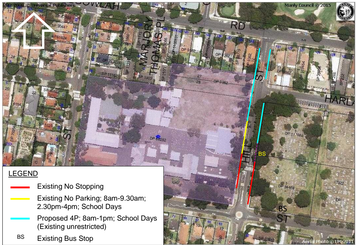
Figure 1: Hill St, Fairlight – Proposed 4P restrictions on school days