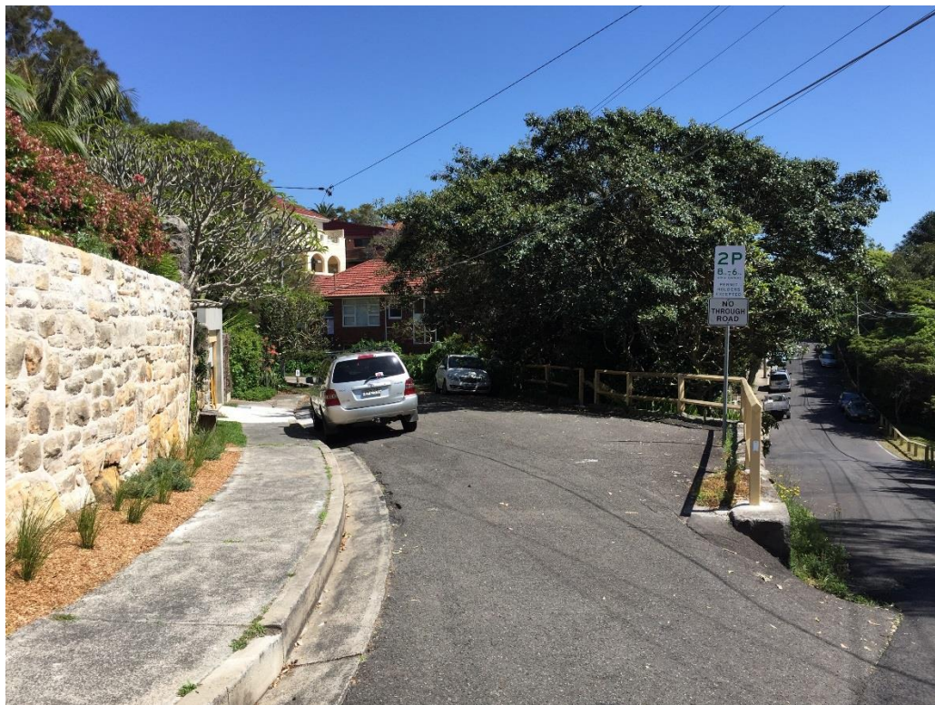
Figure 2: Access looking into Crescent Avenue (photograph taken 16 October 2015)