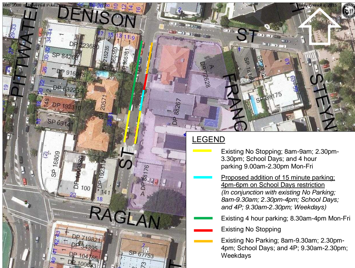
Figure 1: Whistler St, Manly – Proposed 15 minute parking