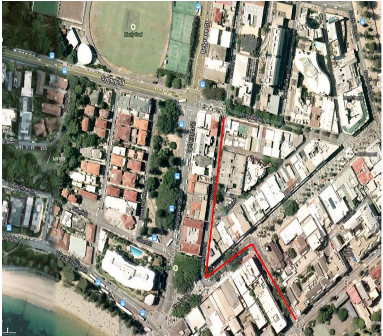
Figure 1: Location of proposed road closure and no stopping restriction

It is recommended that Council approves the Traffic Management Control Plan for Manly Anzac Day Service