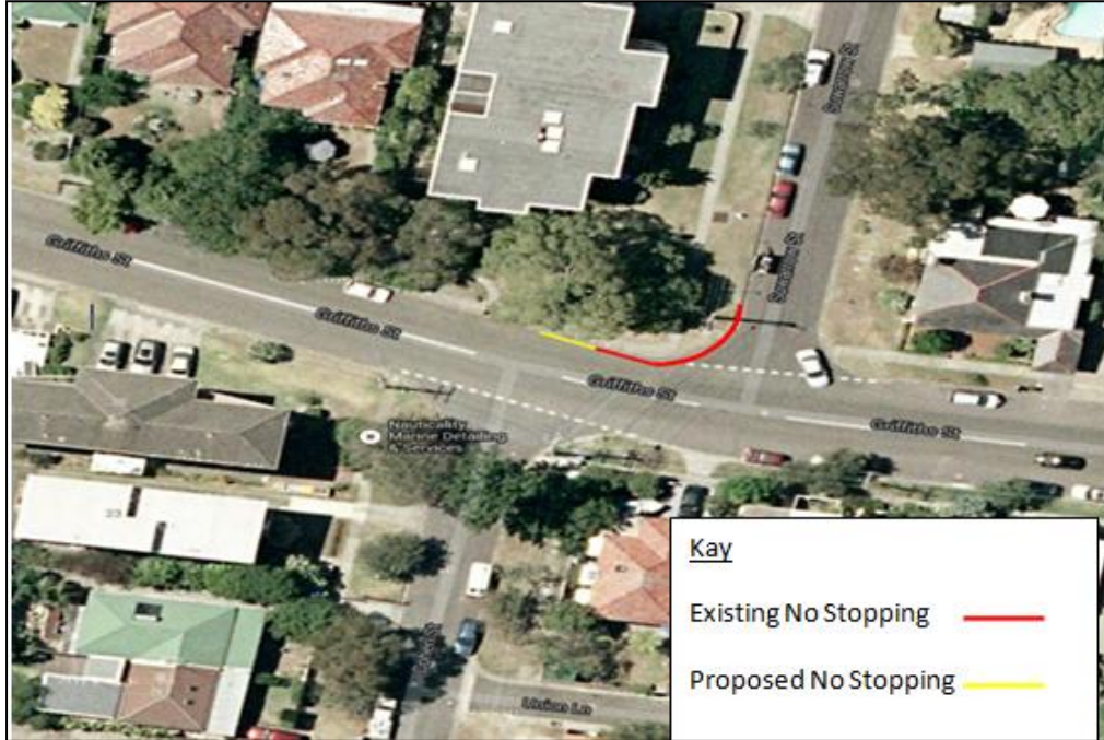
Figure 1: No Parking, Griffiths Street