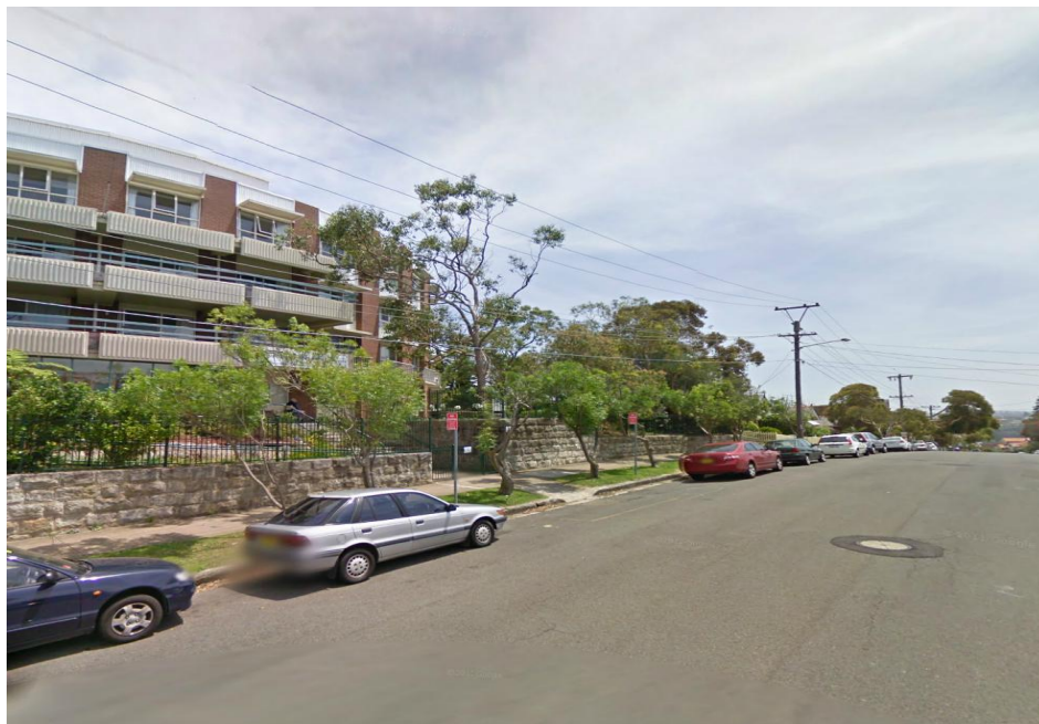
Photo 2: Existing No Stopping and disabled restriction Adopted Manly Local Traffic Committee minutes 10 February 2014