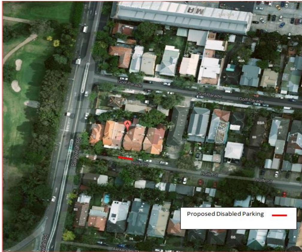
Figure 1: Rolfe Street- Proposed Disabled Parking location