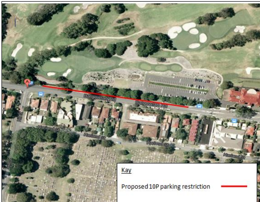
Figure 1: Balgowlah Road -Proposed 10P parking restriction.