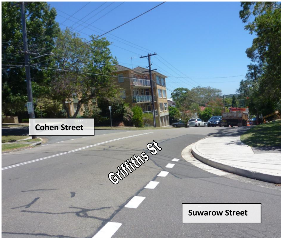
Photo 1: Griffiths Street/Cohen Street /Suwarow Street staggered intersection