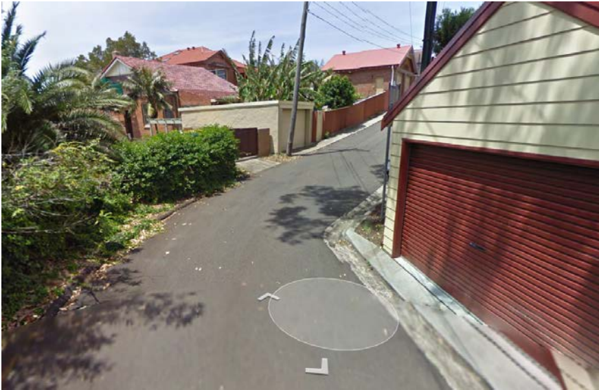
Figure 1: View when travelling in an easterly direction.