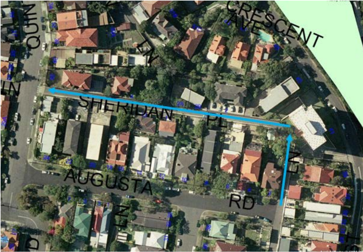
Figure 3: Proposed one way direction for Sheridan Place – entering at Augusta Road and exiting at Quinton Road.