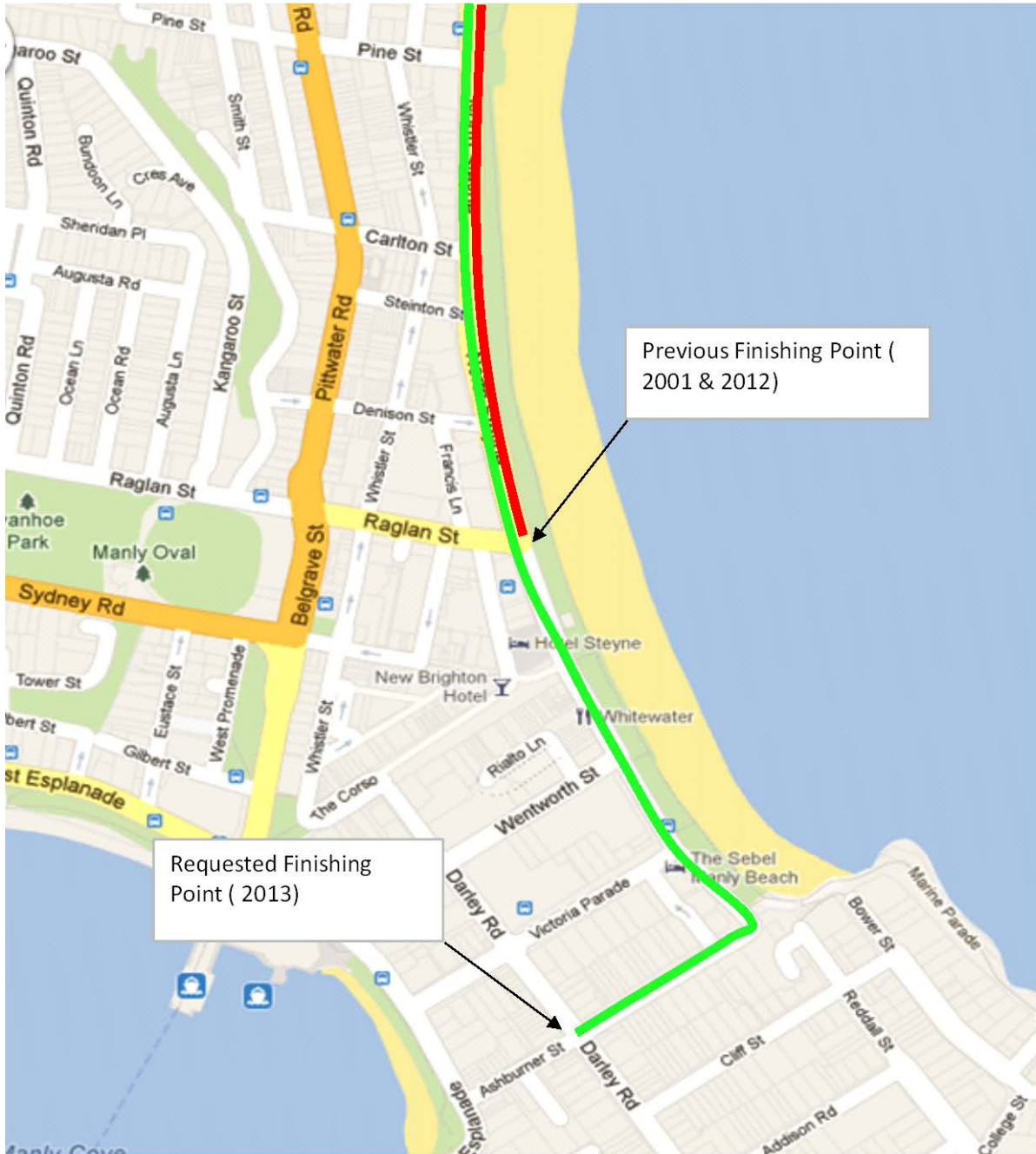
Figure 2. Previous & Proposed Finishing Points