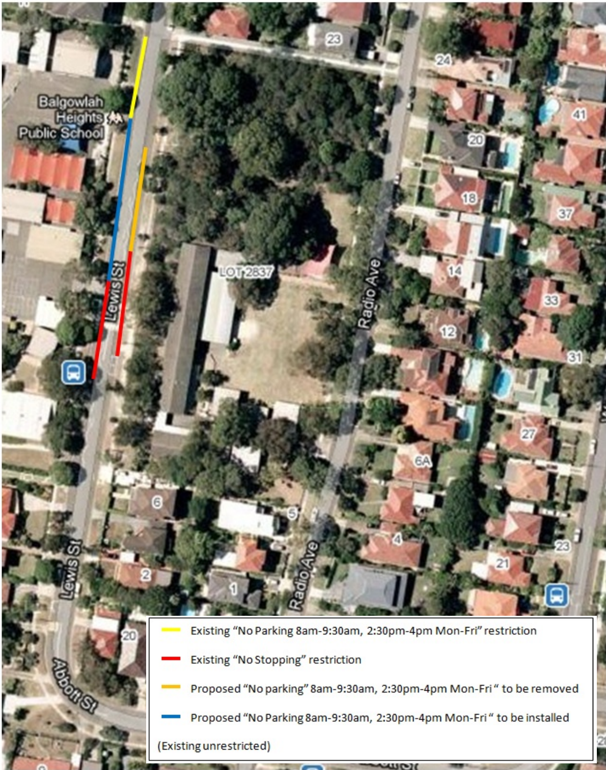
Figure 1: Proposed improvements in parking restrictions – Lewis Street, Balgowlah Heights