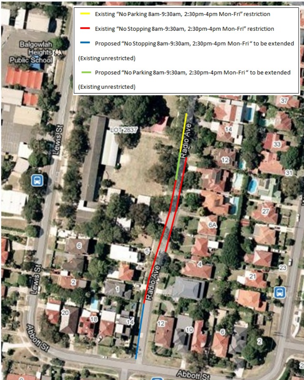
Figure 2: Proposed improvements in parking restrictions - Radio Avenue, Balgowlah Heights