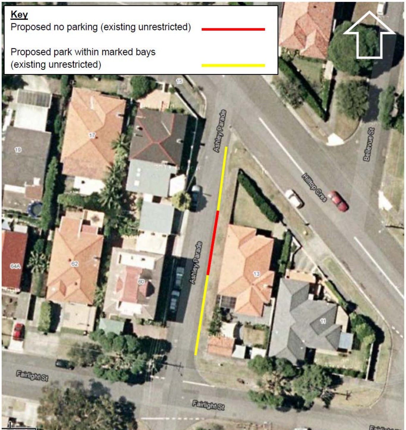
Figure 1 Proposed “No Parking” and park within marked bay restrictions – Ashley Parade, Fairlight