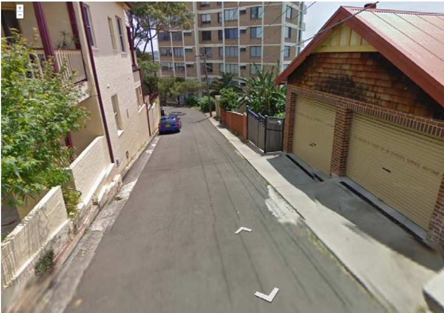
Figure 2: View when travelling north on Sheridan Place.