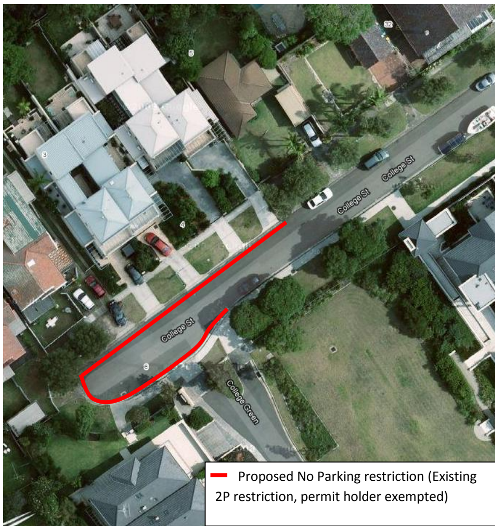
Figure 1 – Proposed No parking restriction – College Street, Manly