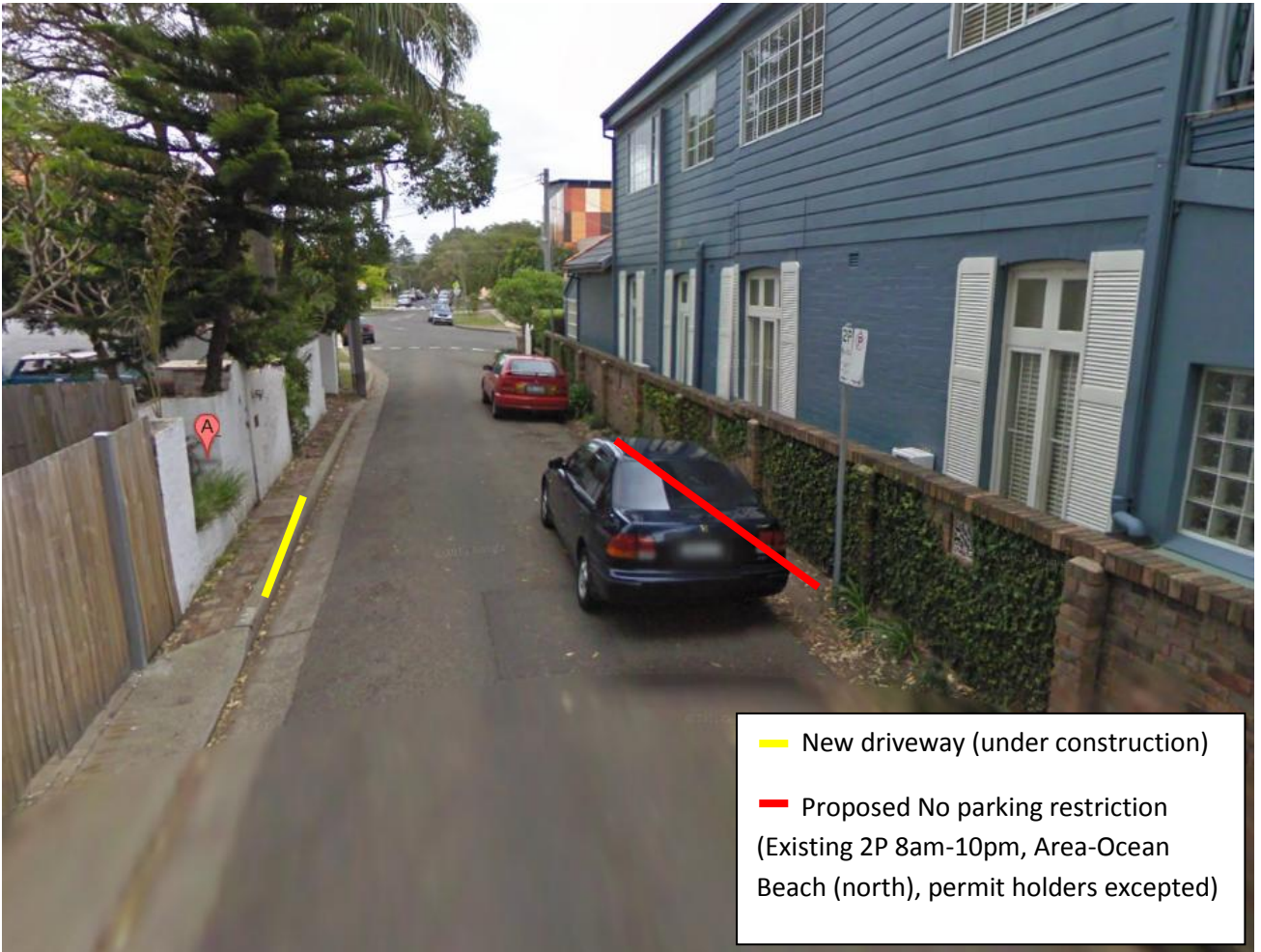
Figure 1: Extension of No Parking restriction – Ceramic Lane, Manly