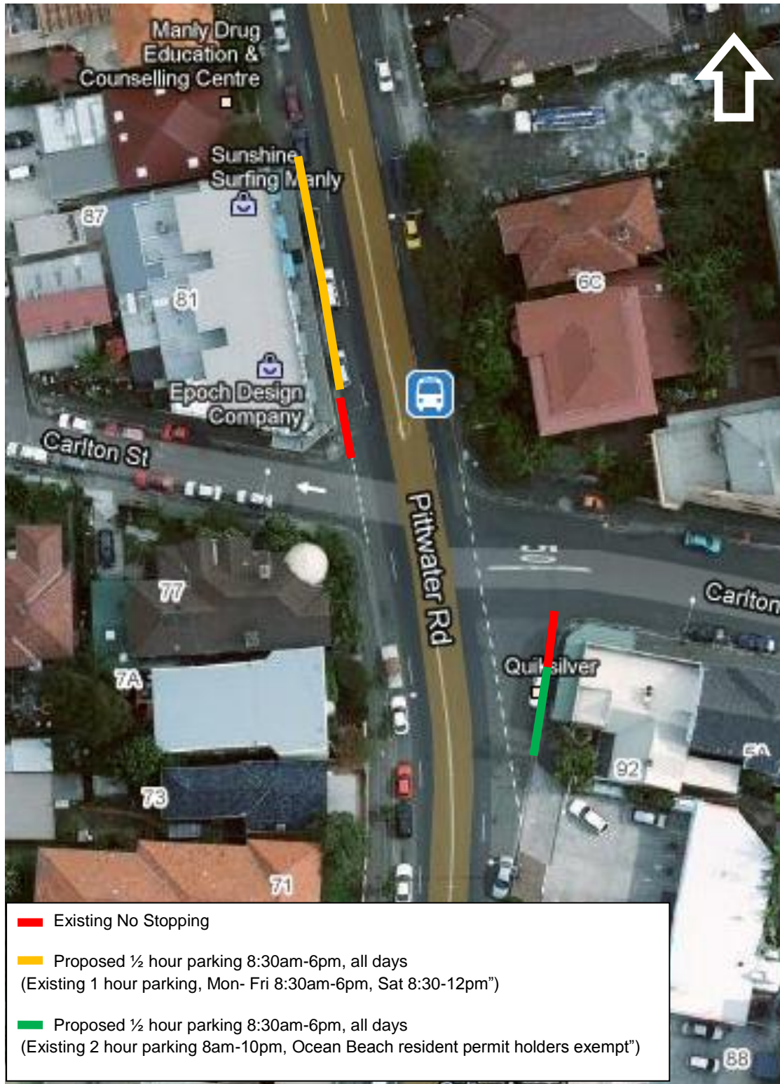
Figure 1: Proposed ½ hour parking restrictions – Pittwater Road, Manly