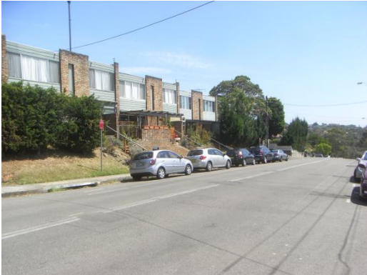
Woodland Street North (Outside No. 205)