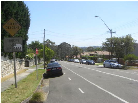
Woodland Street North (Looking North)