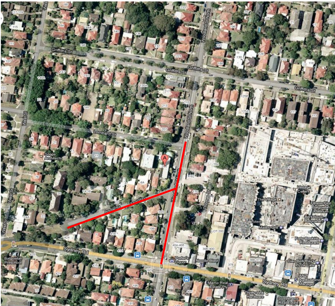
Figure 1- Affected Streets , Woodland Street and Angle Street

The affected streets are highlighted in Figure 1 below.