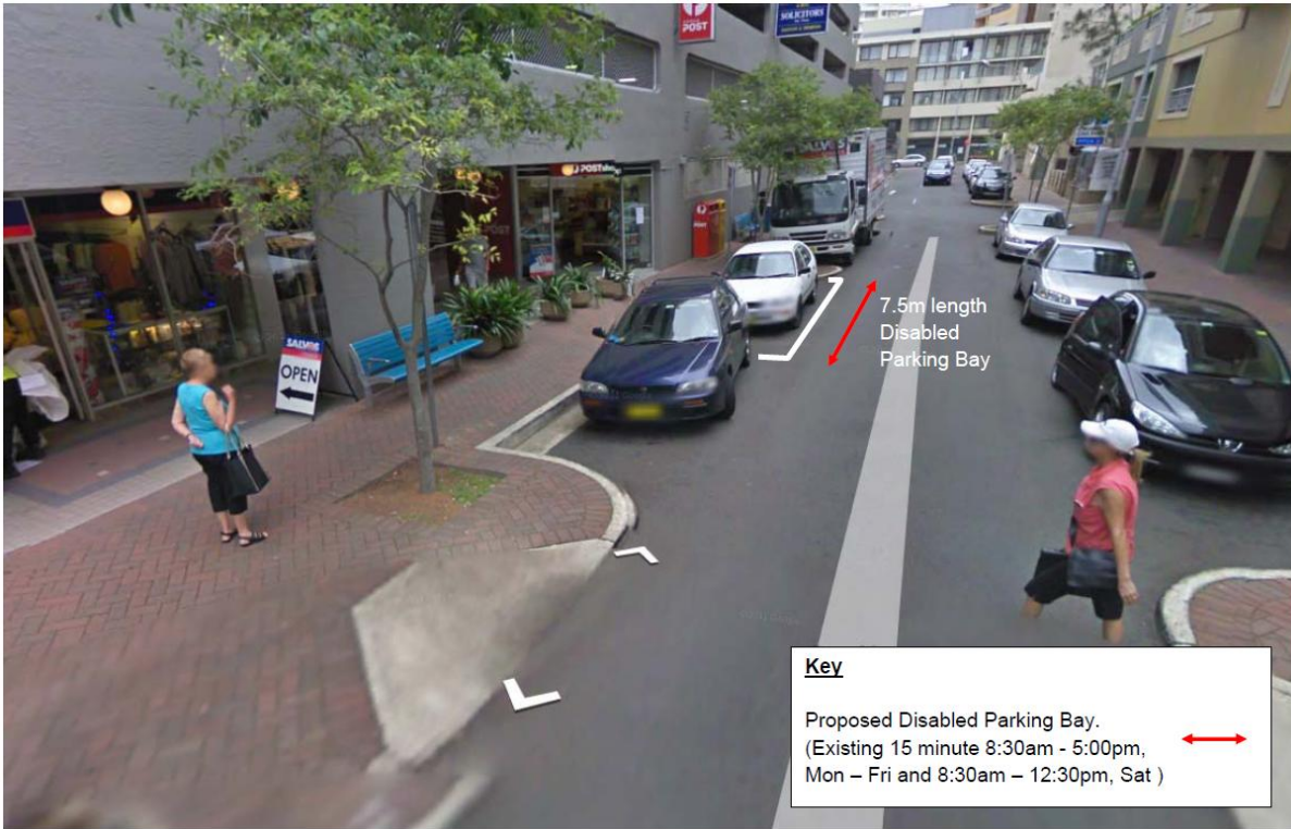
Figure 1: Proposed Disabled Parking Bay – Central Avenue, Manly CBD