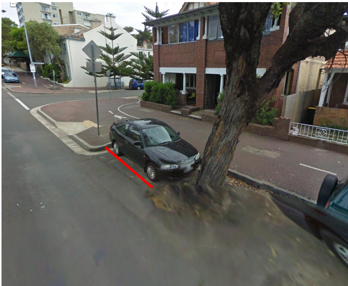
Figure 1: Proposed motorbike only parking spaces – Darley Road