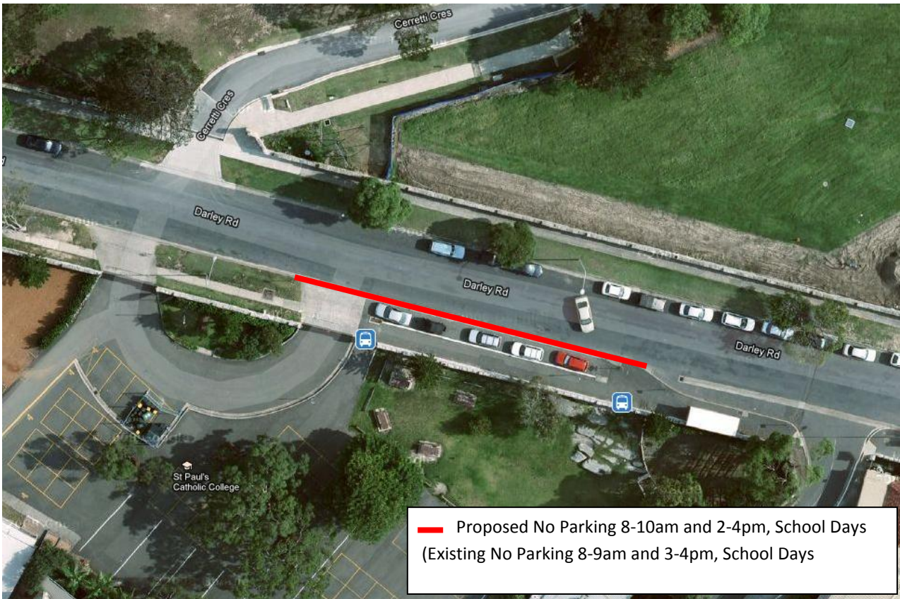
Figure 1: Proposed No Parking 8-10am and 2-4pm, School Days – Darley Road, Manly