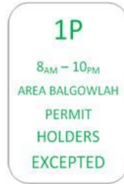
Cormack Street and Learmonth Avenue