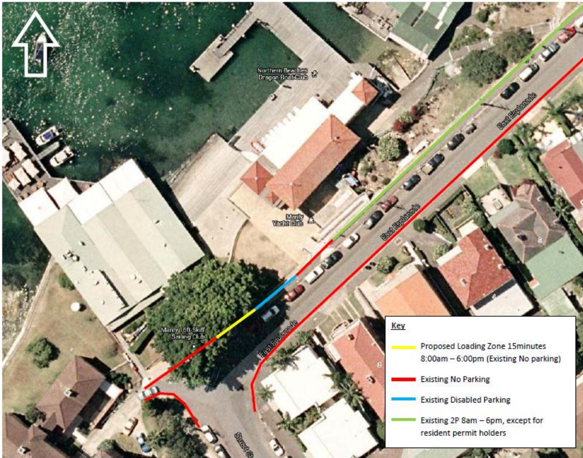
Figure 1 – East Esplanade, Proposed Loading Zone