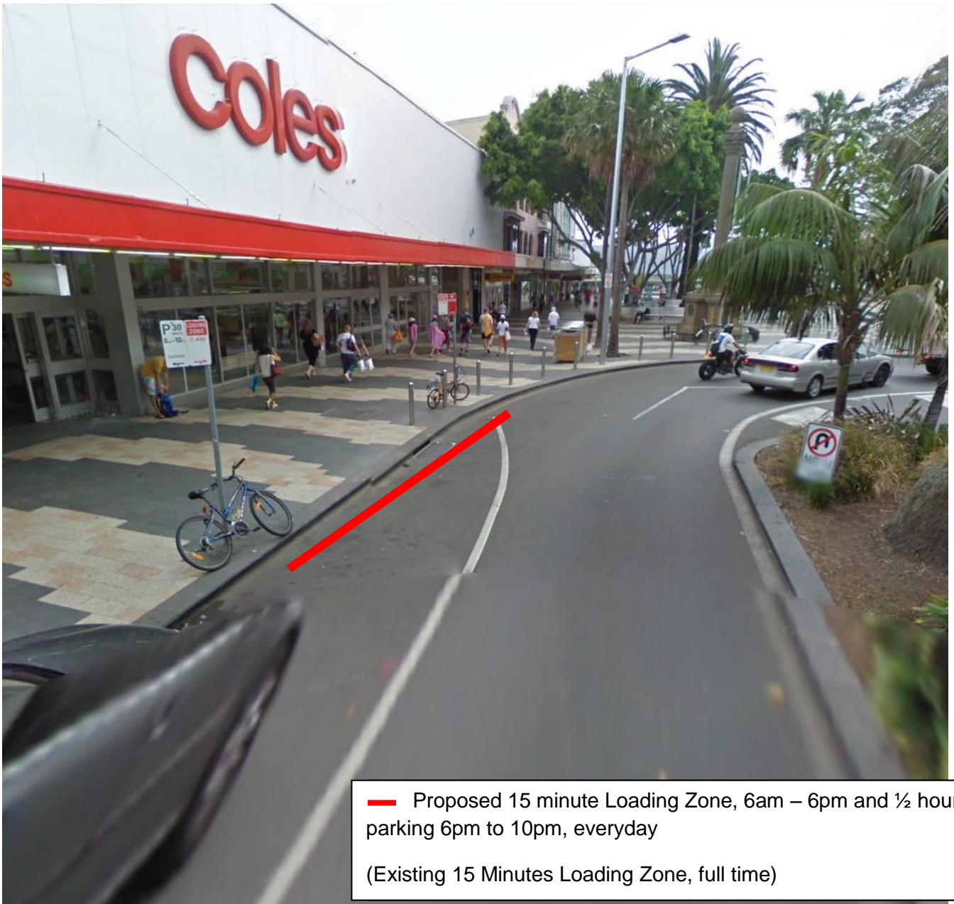
Figure 1: Proposed Change to the times of operation for the existing Loading Zone – The Corso, Manly