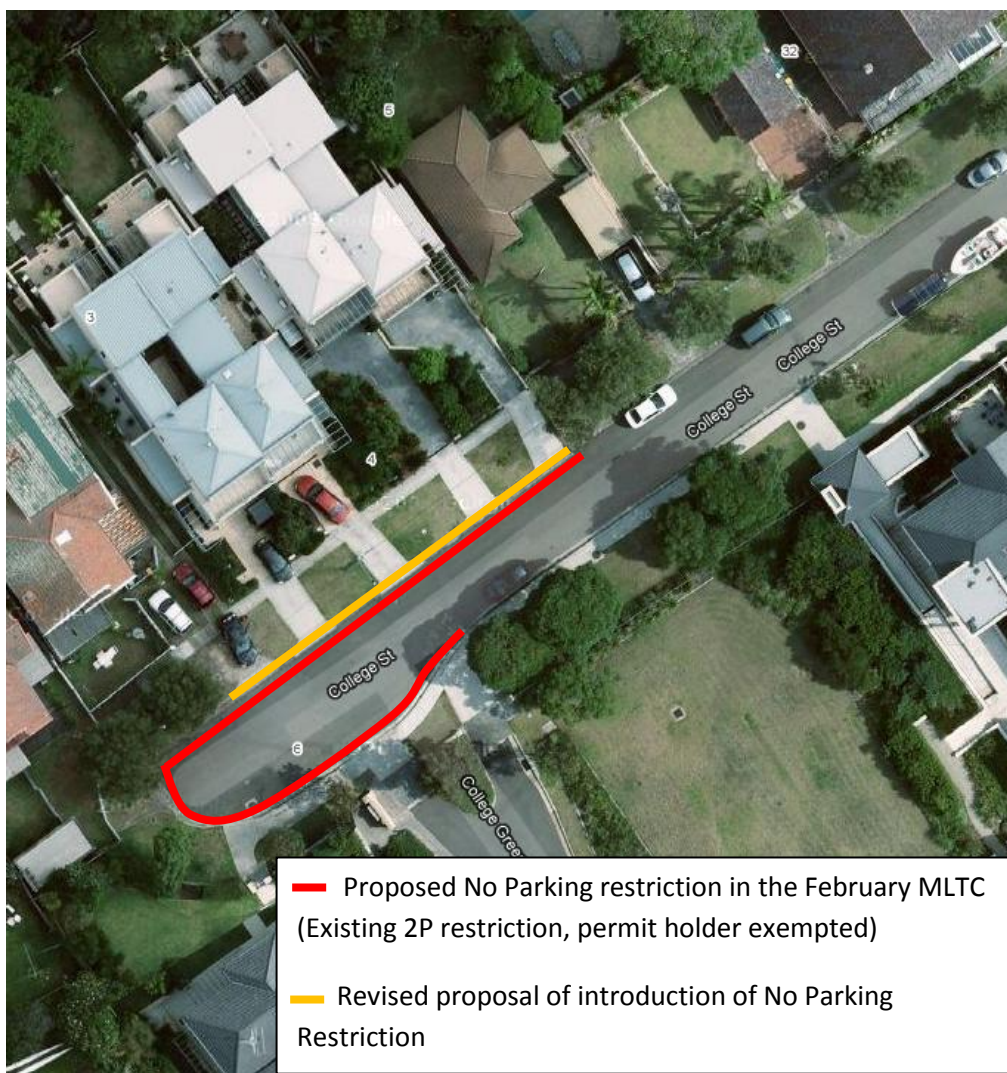
Figure 1 – Proposed No parking restriction – College Street, Manly