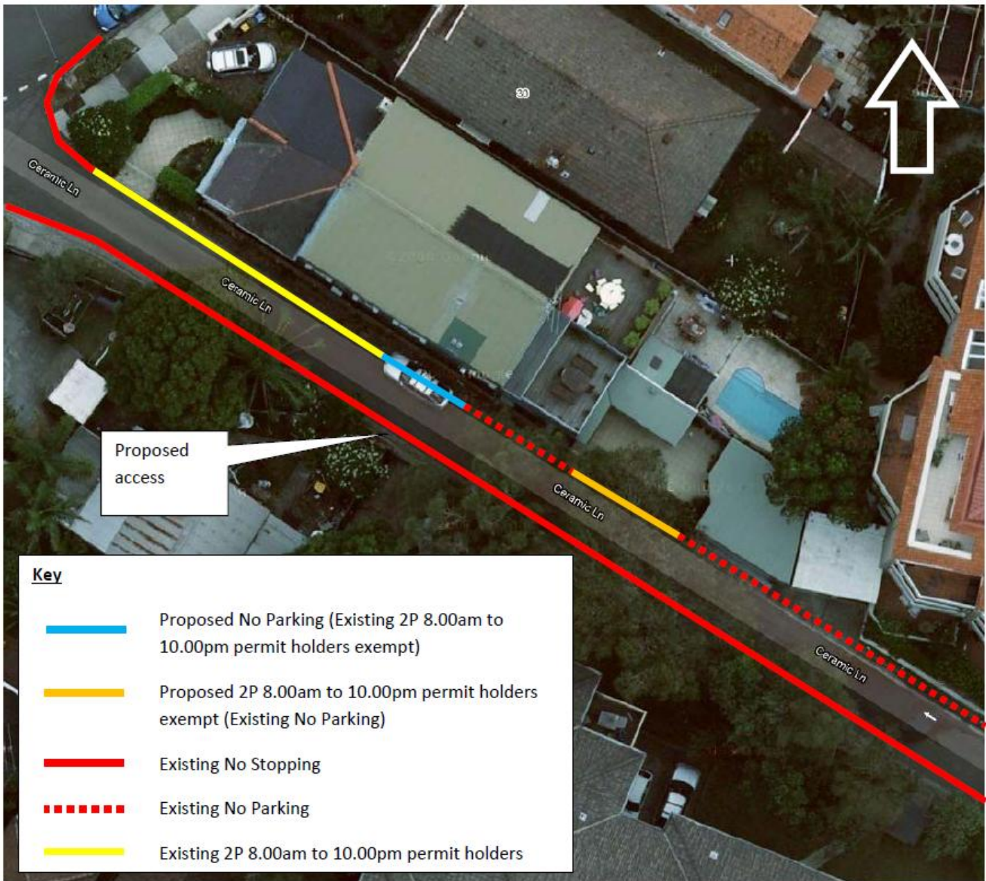
Figure 1: Proposed changes to parking restrictions, Ceramic Lane